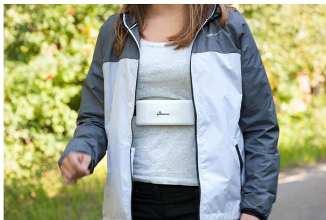
Figure 2. Person wearing the prototype version of the assistive device.