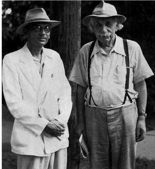
Figure 4: Gödel and Einstein

ening the whole system's stability. Then he focused to prove the same compatibility with axiomatic system for continuum hypothesis and axiom of choice's negation. In that way he could affirm that the continuum hypothesis and the axiom of choice were totally independent from all the rest of math. The great paranoia that was afflicting him, rapidly worsened. Beyond every persecutive maniae, that became stronger and stronger, he tried to prove that Leibniz had not developed his own theories. Luckily, next to that imaginary certainty, Gödel knew Einstein, with who he began a deep relationship. This friendship, if we can call it a friendship, was supported by two main factors: Einstein preferred to keep on speaking German, Gödel's mother language, and both Einstein and Gödel, even if they had opposite natures, shared physical and philosophical interests.