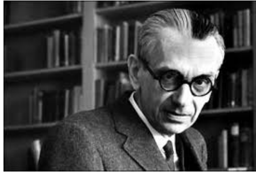
Figure 3: Kurt Gödel, Brno, 28 April 1906 – Princeton, 14 January 1978