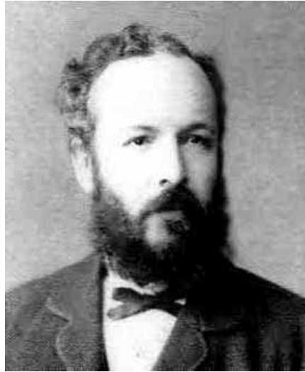
Figure 1: Georg Cantor, St Petersburg, 3 March 1845; Halle, 6 January 1918

that he was occupying previously (using Galileo's correspondence), or with the number double of the one occupied previously. In the first case we would have free all the rooms which number is not a perfect square, in the second case, all the rooms marked with an odd number.