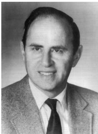
Figure 5: Paul Cohen, April 2, 1934 – March 23, 2007