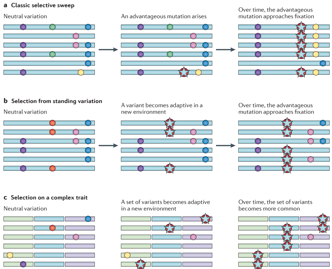
Figure 1 | Genetic signatures of positive selection. Each panel depicts changes in variant frequencies over time. Variants are shown as circles on the oblong chromosomes, and advantageous variants are represented with a star. a | A classic selective sweep, in which a novel adaptive variant arises in a population and increases in frequency over time until it approaches fixation, leaving an excess of linkage disequilibrium with surrounding variants and a decrease in levels of genetic variation. b | Selection from standing variation, in which a variant that is already present in the population becomes advantageous in a new environment and increases in frequency over time until it approaches fixation. Because the variant exists on different haplotype backgrounds, it cannot be easily detected using tests of extended haplotype homozygosity. However, when this happens in a regionally restricted manner, there is a resultant excess of allele frequency differentiation in the population being subjected to adaptive pressures, relative to a population for which the variant does not confer a selective advantage. c | Selection on a complex trait involving multiple loci on different chromosomes (represented by oblongs in different colours); when this trait becomes advantageous, it increases in frequency as a set, leaving a more subtle signature of adaptation which may include subtle shifts in allele frequencies at multiple loci.

as a known recombination map. Therefore, any uncertainty or error in these input data will bias the results and inferences made from such analyses. Moreover, genomic heterogeneity in background levels of purifying selection 39 , mutation rates, structural variation and recombination rates can result in spurious candidates for natural selection 40,41 .